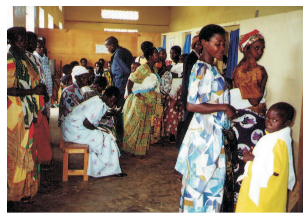
another busy day at the clinic

e-mail: Bram@iccf-holland.org giro: 4548774